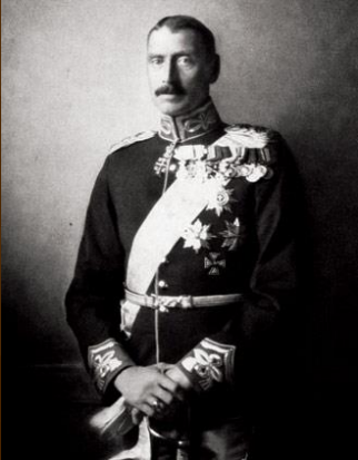
An official photo of King Christian X of Denmark and Iceland (King of Denmark 1912-1947 and of Iceland 1918-1944).

Public Doman Photo In European Union Term